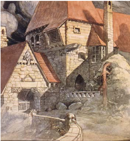
3. Eliel Saarinen, A villa study. Ateneum